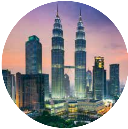
kuala Lumpur 2017