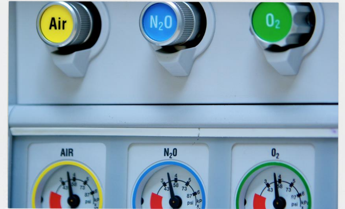
Reducing anaesthetic gases