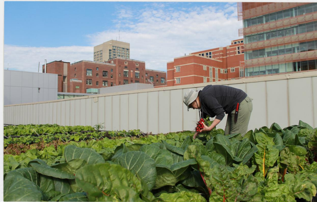
Hospital kitchen garden